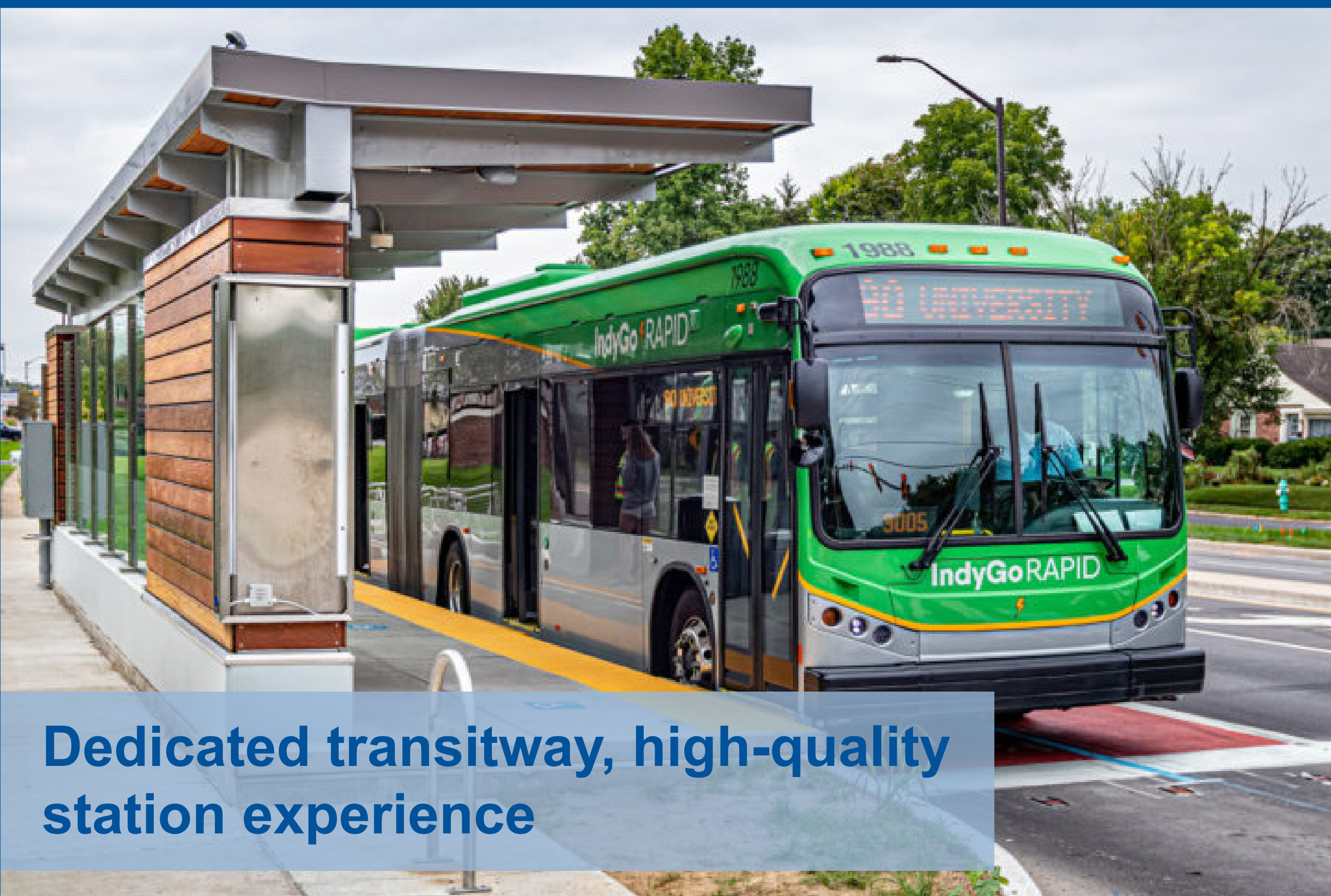
Dedicated transitway, high-quality station experience