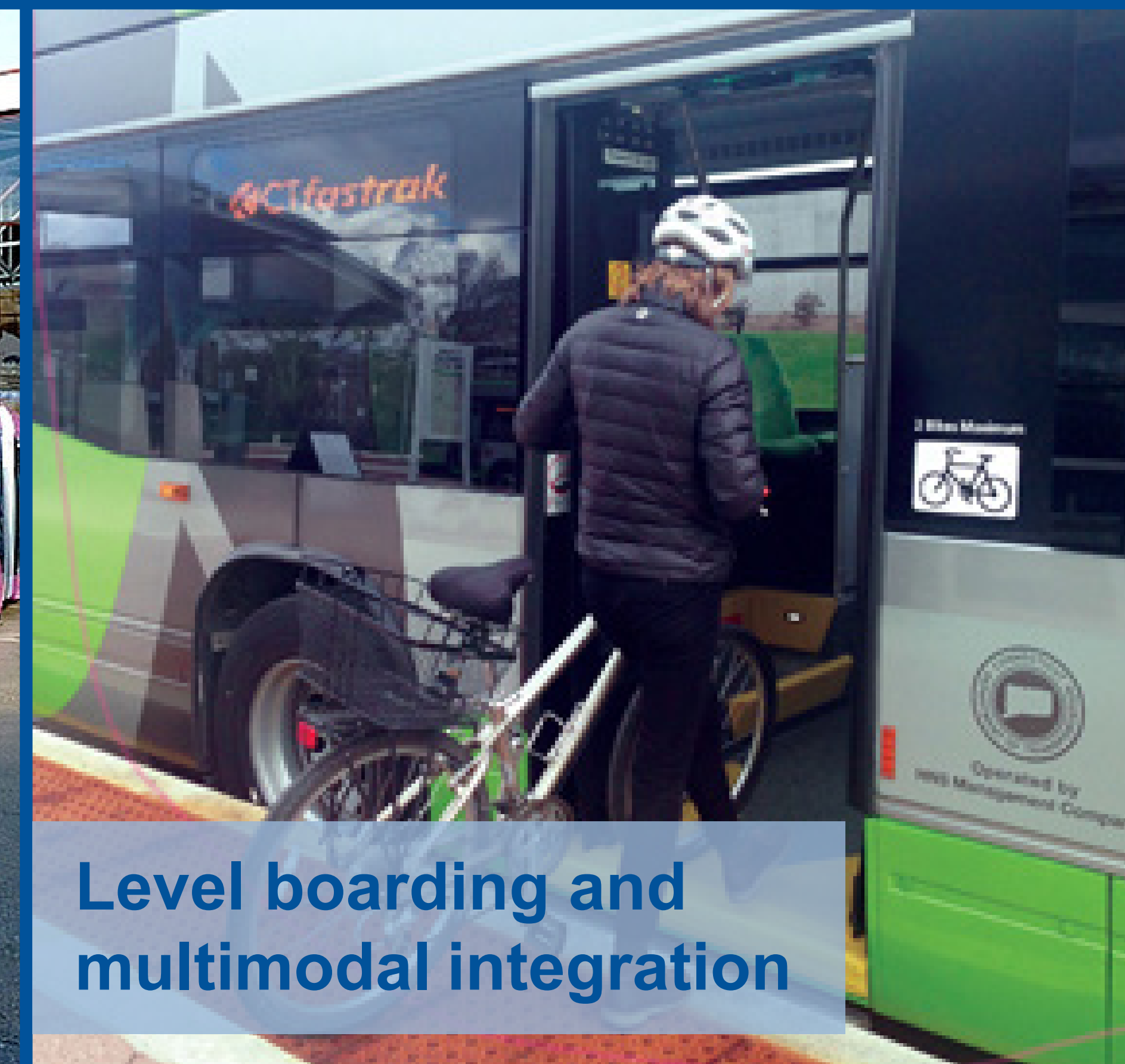
Level boarding and multimodal integration