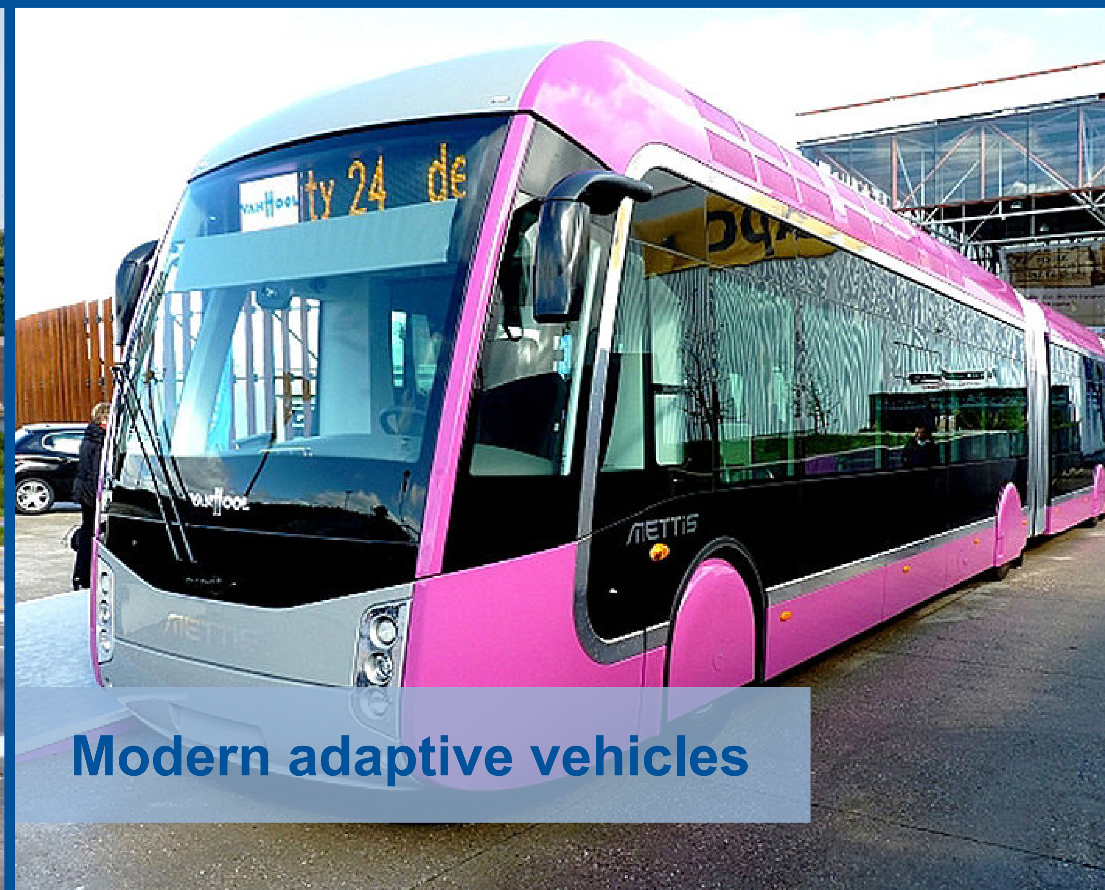
Modern adaptive vehicles